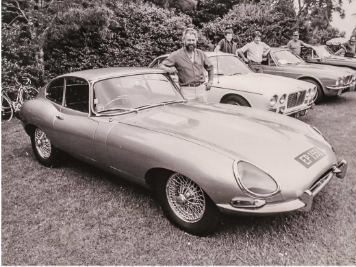
Maurice Cowling - E-Type (4.2l)