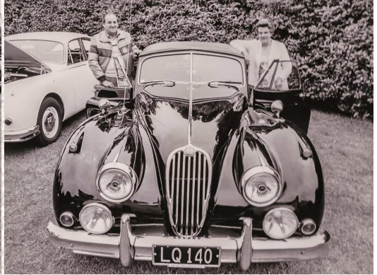
XK140 O.H.C. with Owners