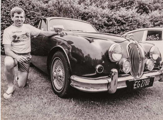
Kevin Mills - Mk 2, 2.4l on wires