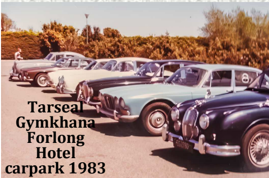
Tarseal Gymkhana Forlong Hotel carpark 1983