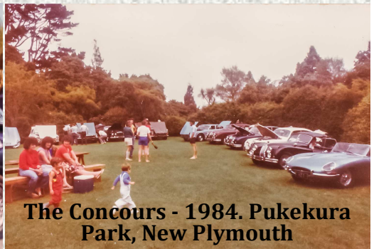
The Concours - 1984. Pukekura Park, New Plymouth