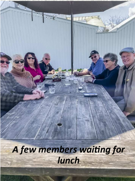
A few members waiting for lunch

And a little Suzuki with a rather impatient driver on board... all that passing, and she still had to wait for the green light with the rest of us.