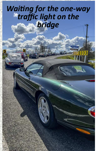
Waiting for the one-way traffic light on the bridge